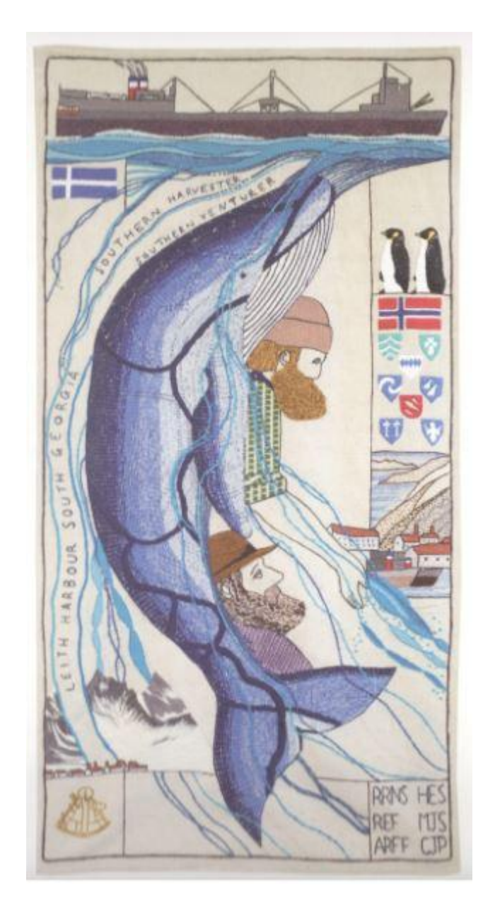
7 - Panel 124 – "Whaling" (Moffat 248)