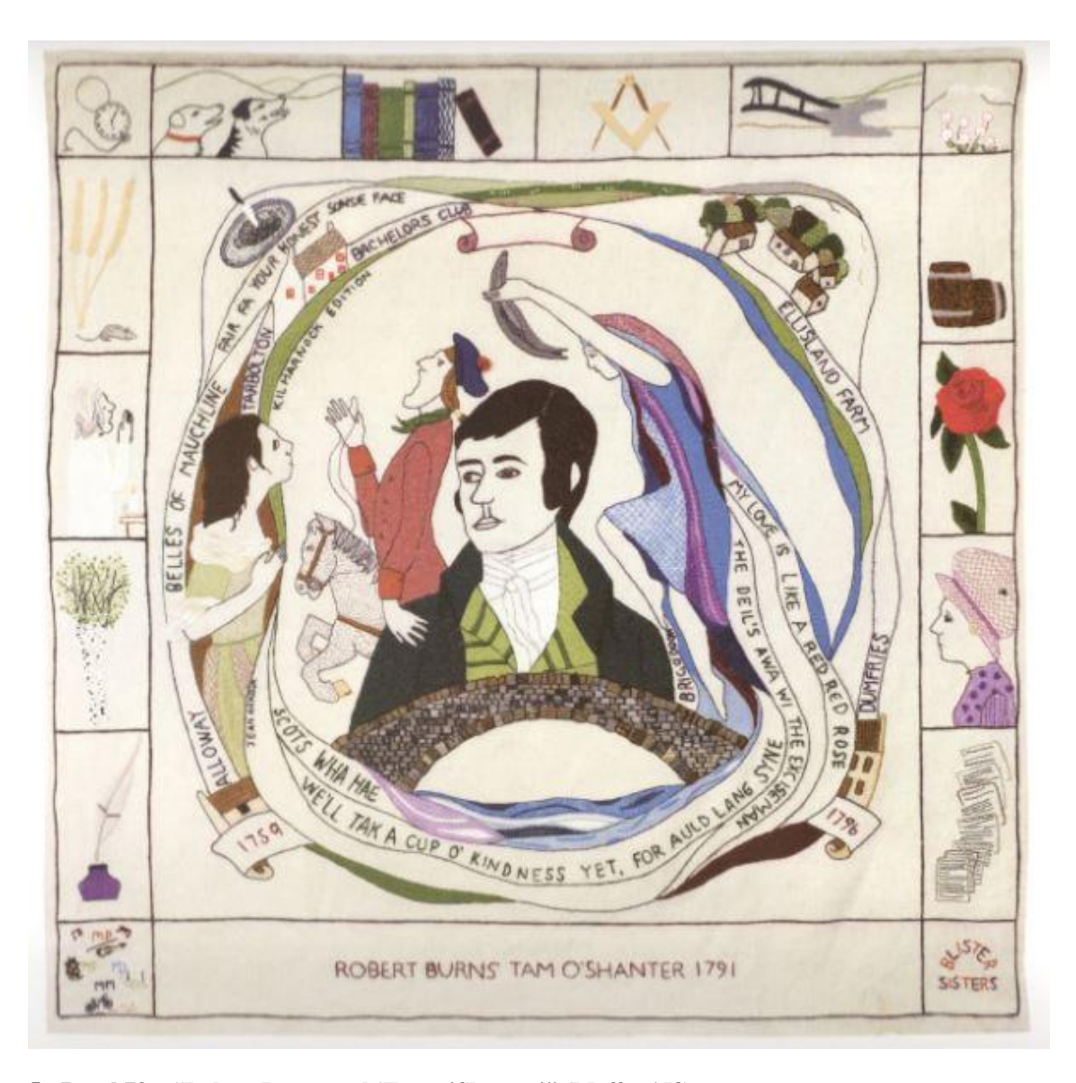
5 - Panel 79 – "Robert Burns and 'Tam o'Shanter'" (Moffat 158)