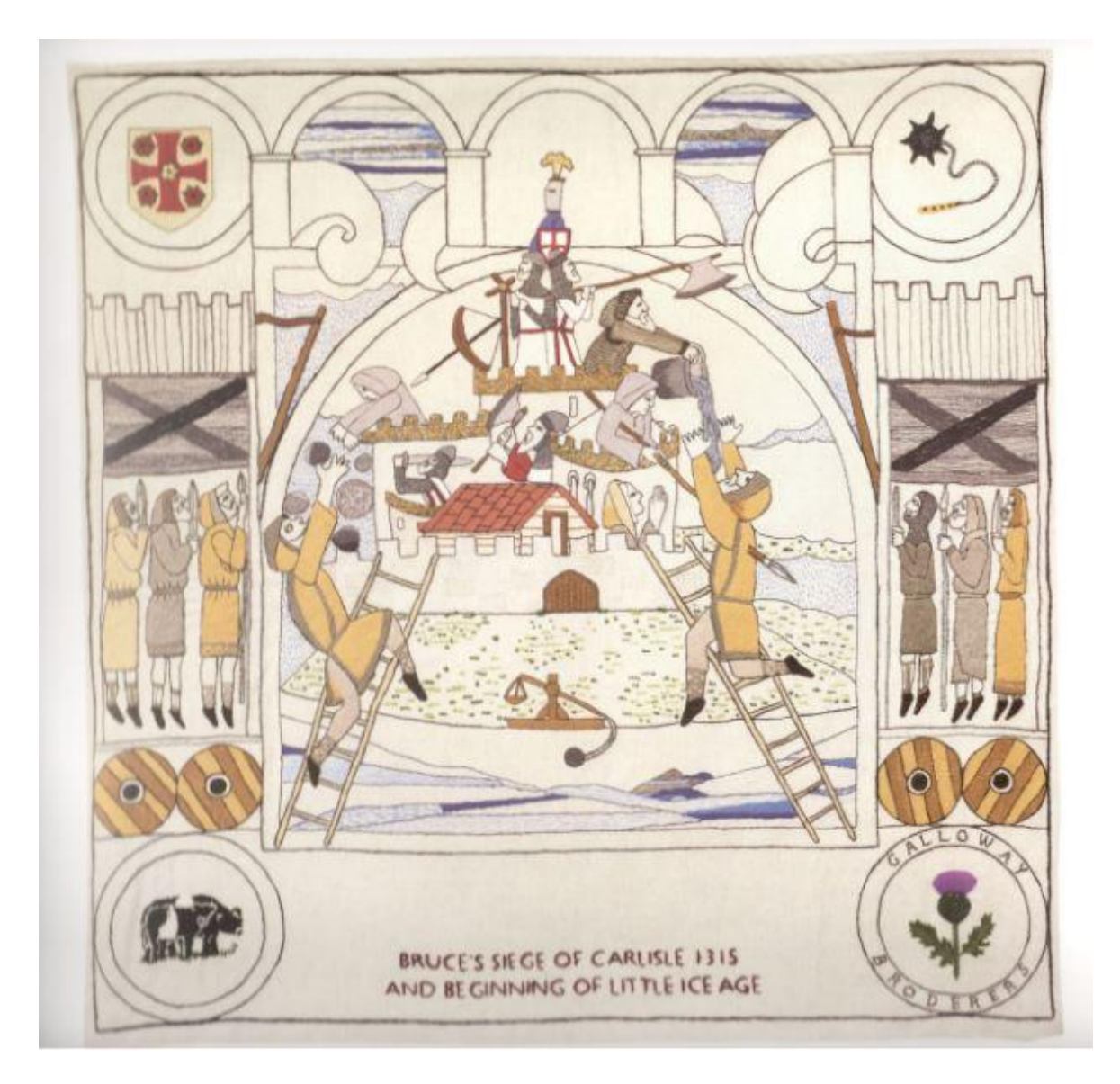
1 - Panel 31 – "The Rain at Carlisle" (Moffat 62)

Examples of the panels of The Great Tapestry of Scotland follow: