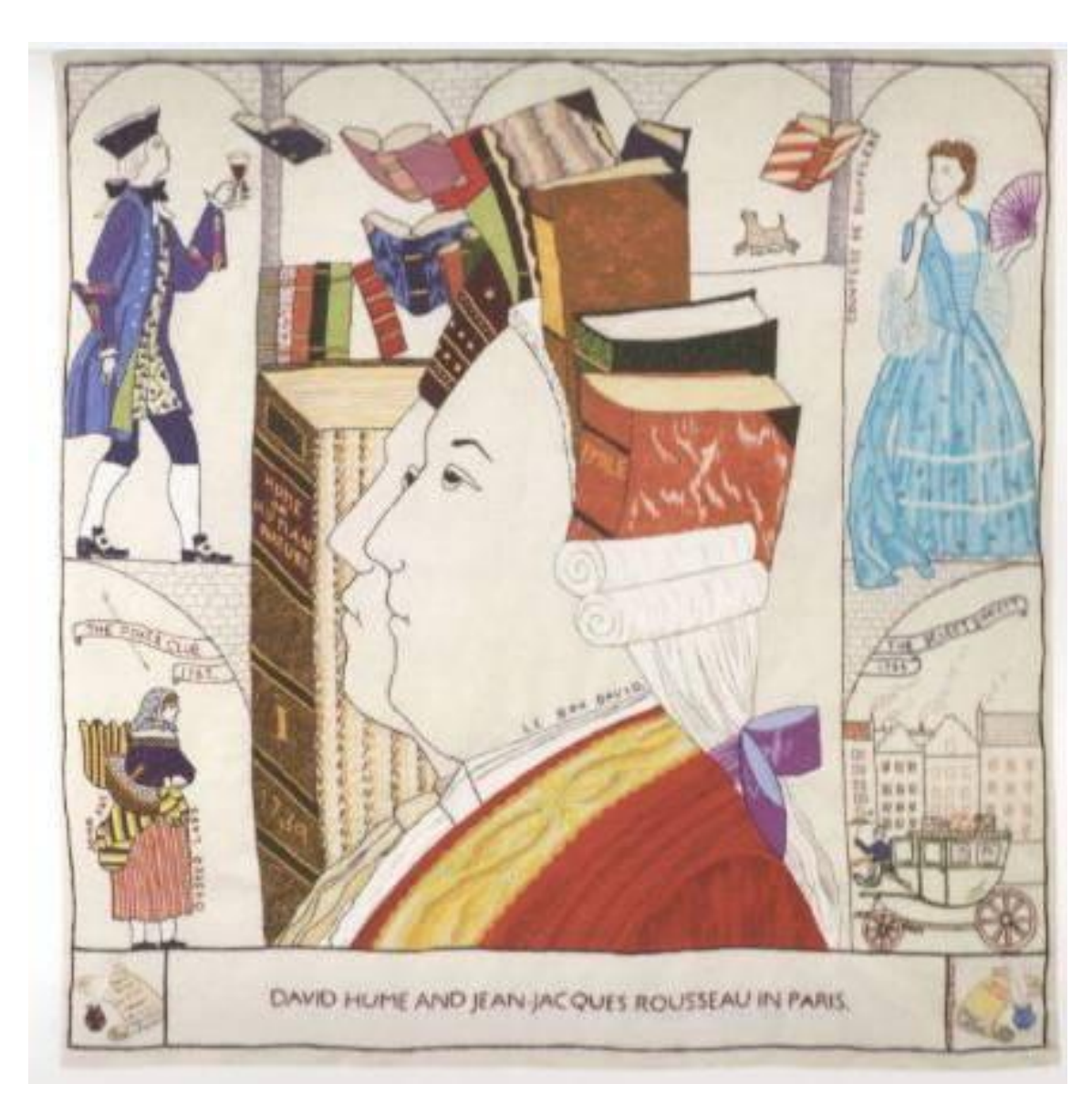
4 - Panel 71 – "David Hume and Jean-Jacques Rousseau" (Moffat 142)