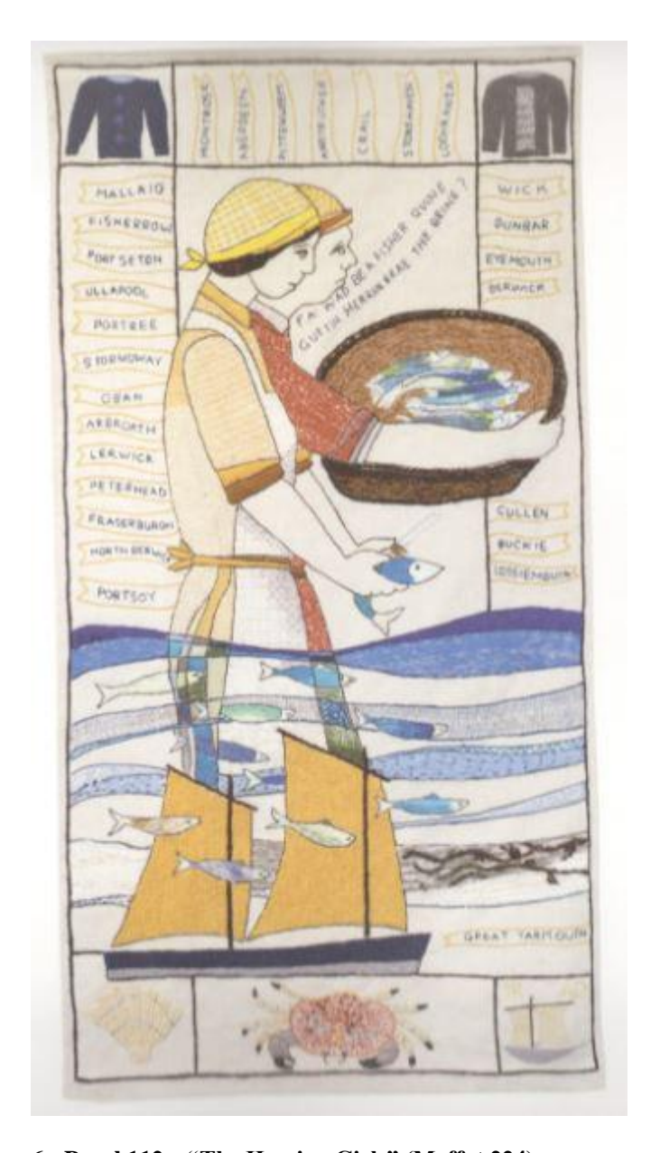
6 - Panel 112 – "The Herring Girls" (Moffat 224)