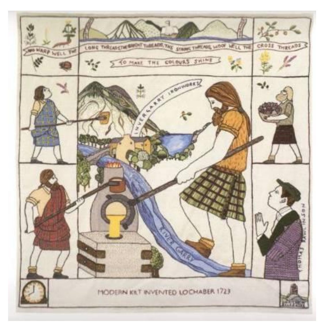
3 - Panel 59 – "The Kilt" (Moffat 118)