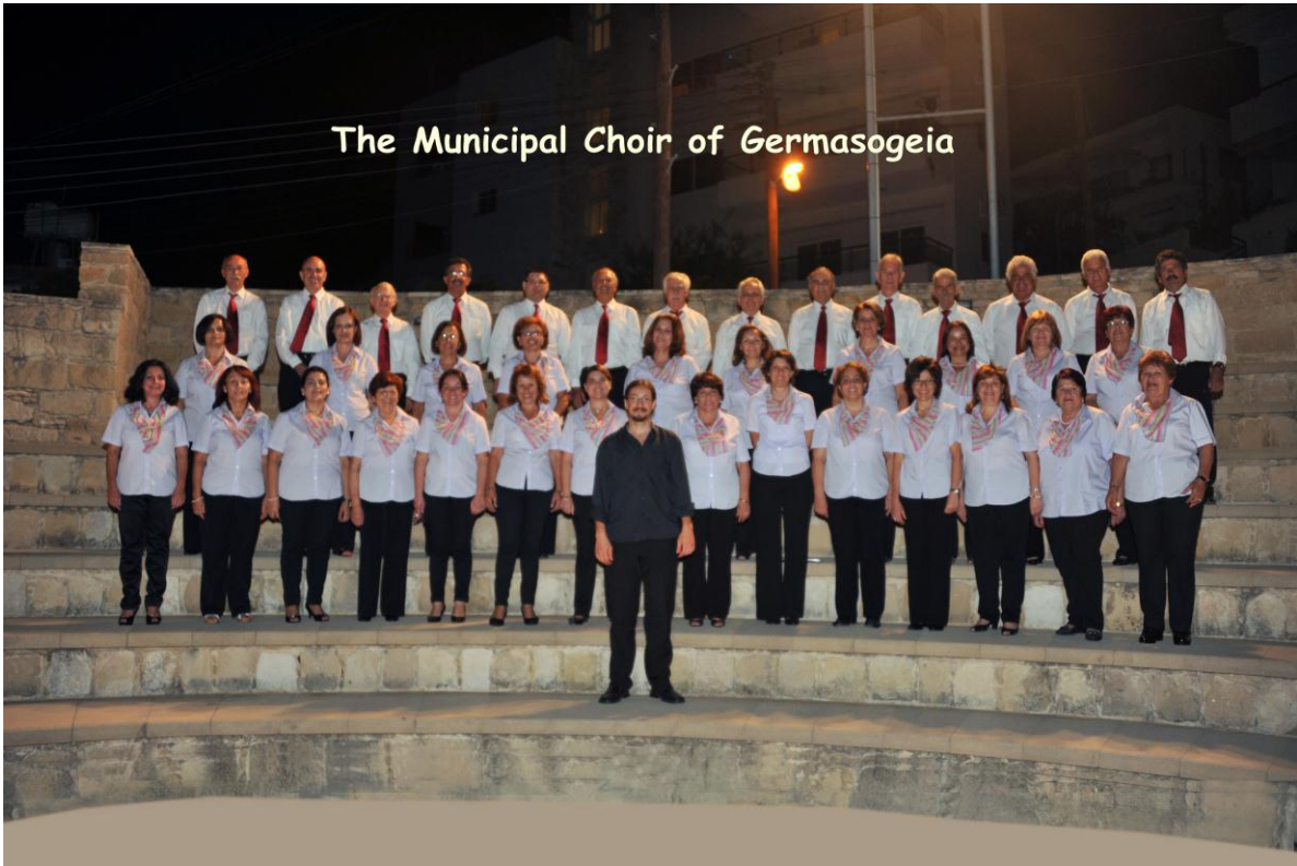
The Municipal Choir of Germasogeia