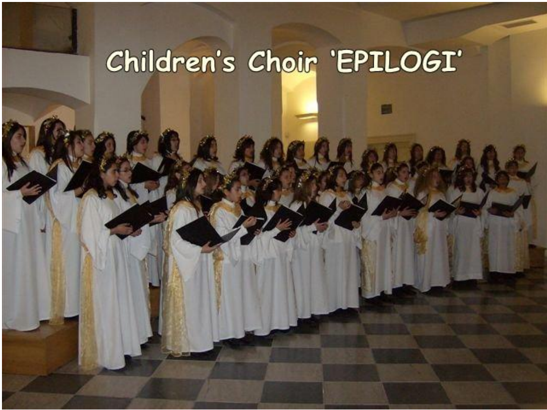
Children's Choir 'EPILOGI'