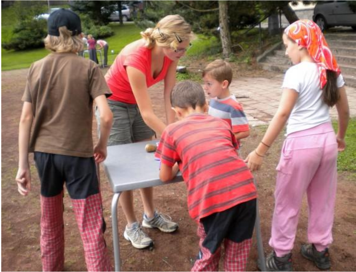
Another activity designed for the gifted children by Mensa.