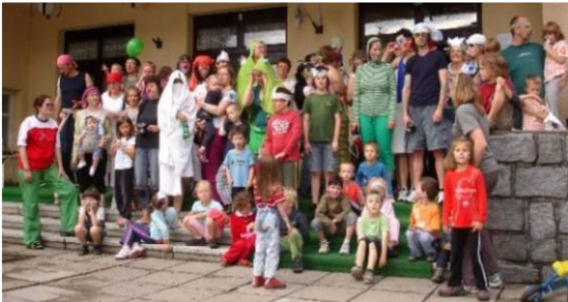
Another photo taken during the summer camps for families with gifted children.