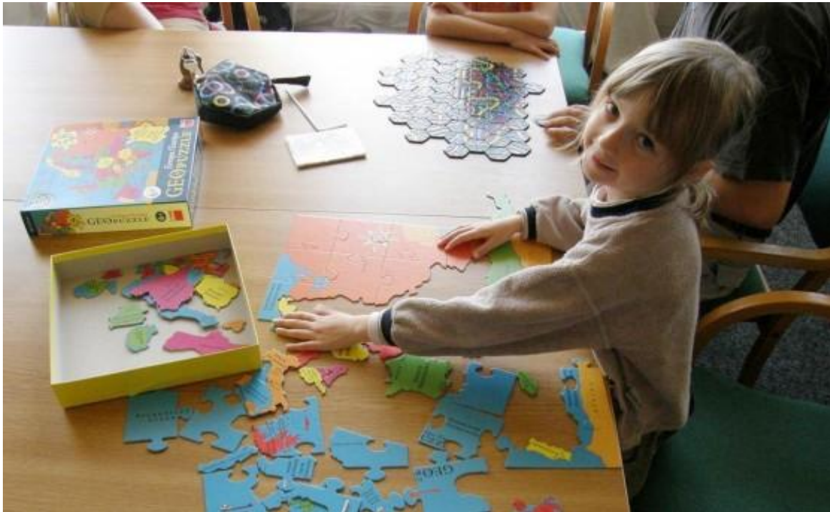
One of the happy participants of the summer camps for families with gifted children. Here, families are invited to various activities focused on team-building and understanding.