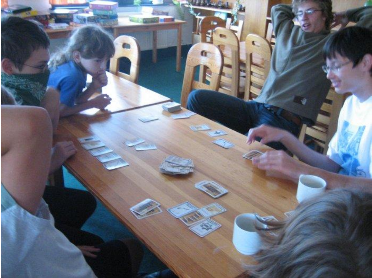
One example of using the board games for creating a relaxed atmosphere. Here, the players play a session of BANG!.