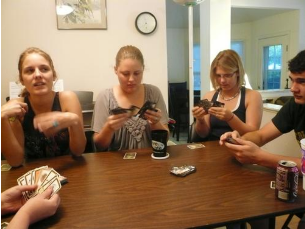
Photo illustrating the game of Once Upon A Time. It is clear to see the current Storyteller, with her story unfolding, while the others try to interrupt her with a suitable card.