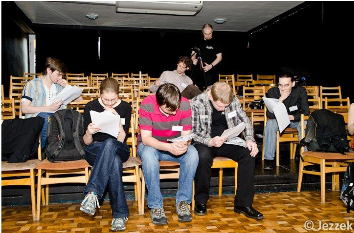
The first part of each LARP. Players are introduced to the game rules and they choose their characters for the main game.