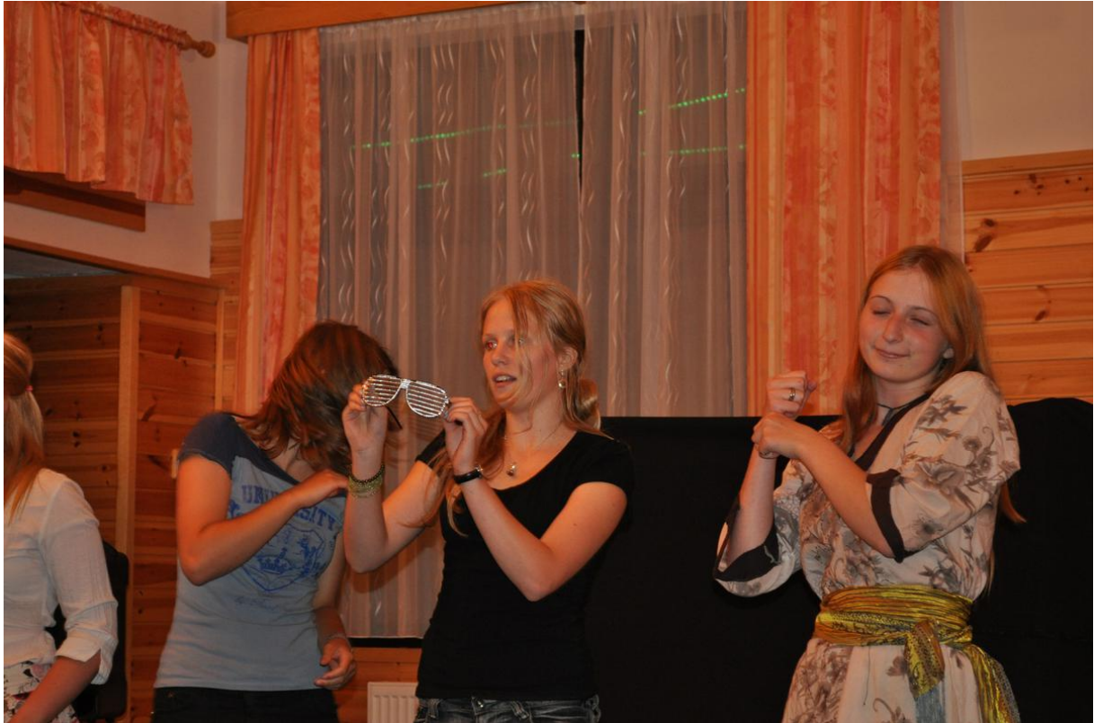
Photo taken from a performance after playing games similar to those shown on the pictures above. After losing much of their shyness, individual participants were more than active in creative ideas concerning the play itself.