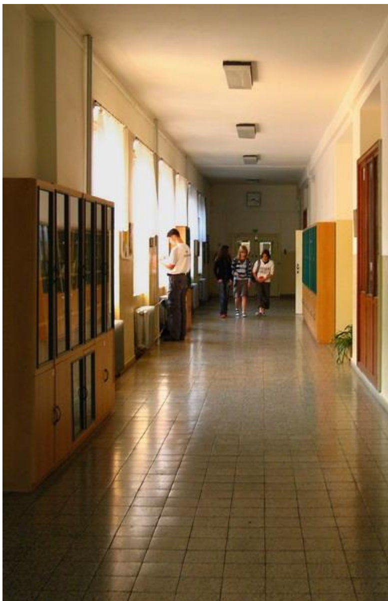
The interior of Menza gymnasium.