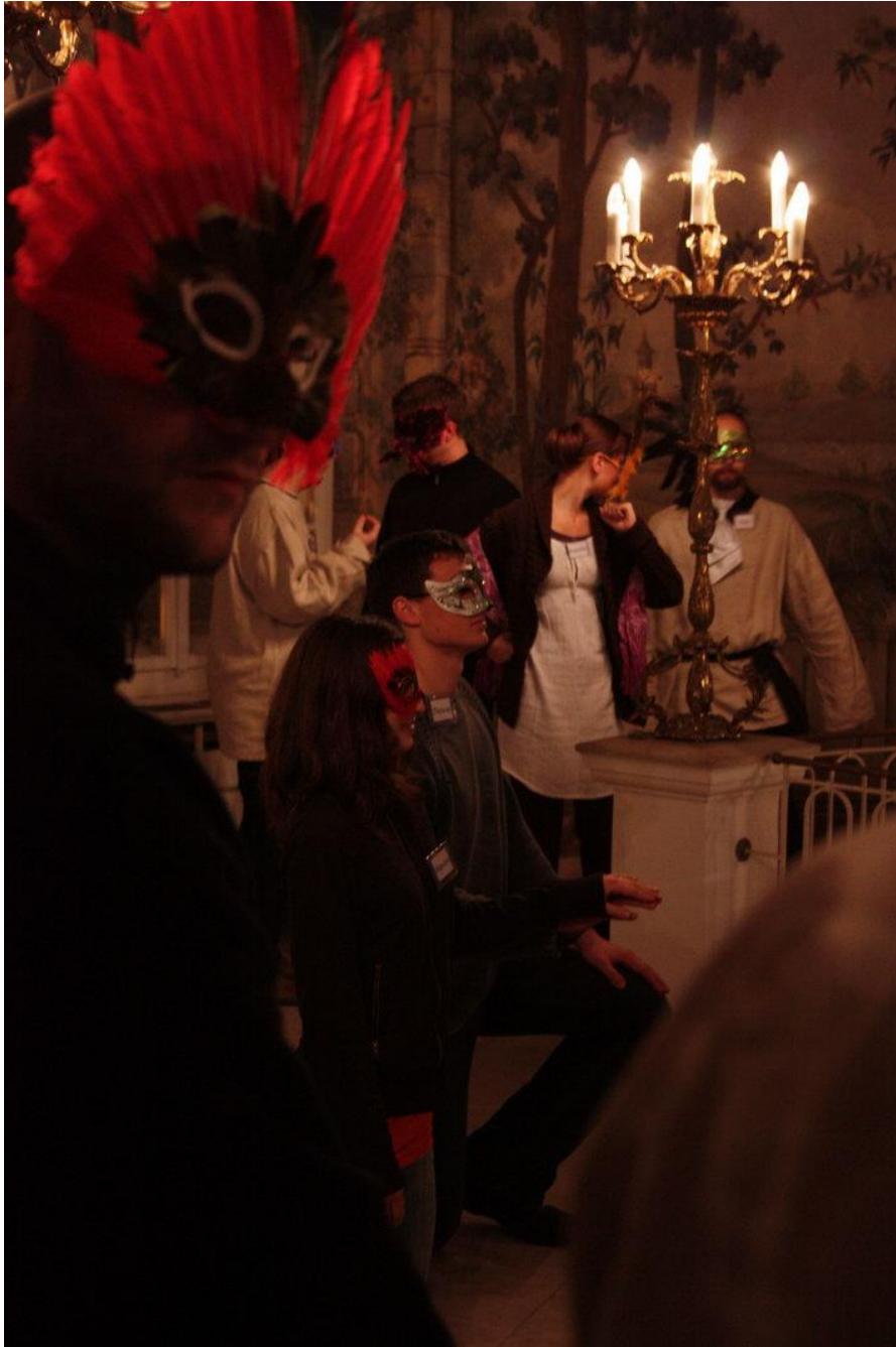
“A Midsummer Night’s Dream” LARP, inspired by the comedy of William Shakespeare. For game purposes, each of the characters wears a mask.