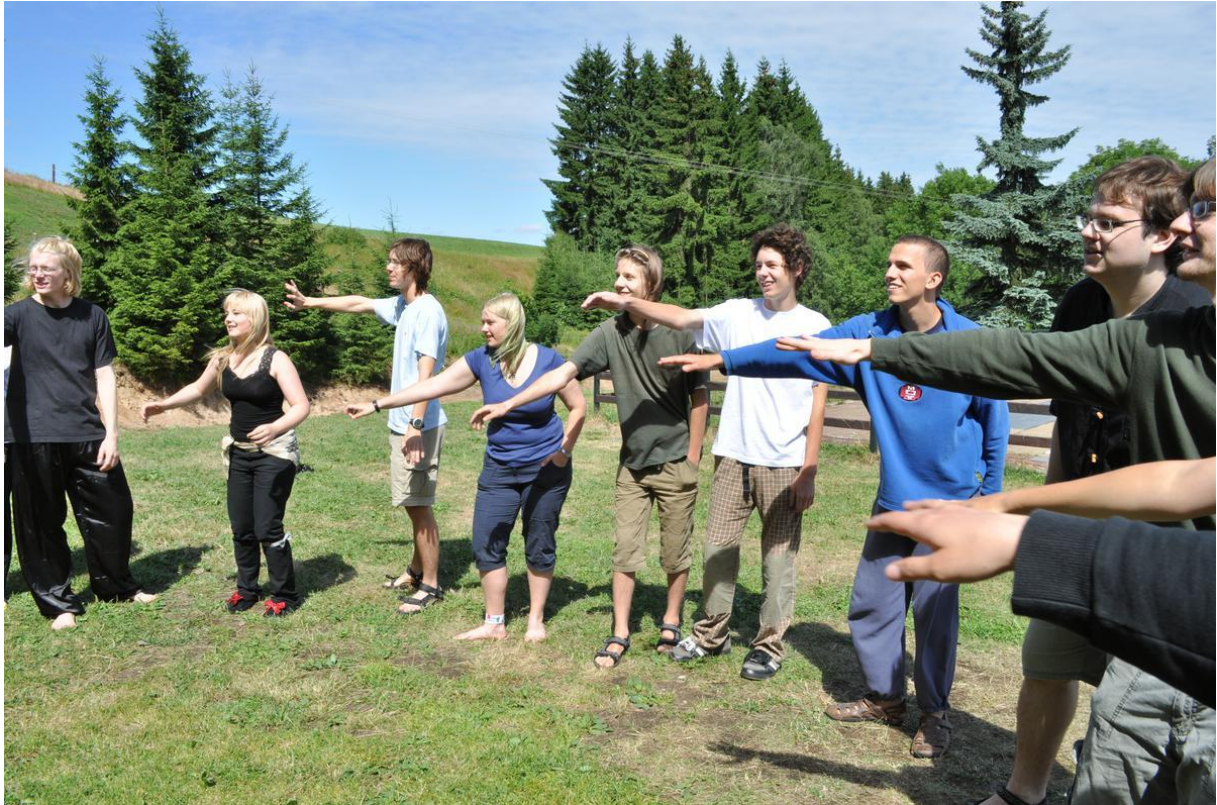
Another activity of the drama section. Here, the participants are to sing a well-known song (here, they sing “Na tý louce zelený”). As the game continues, words from the song are replaced by gestures. This works extremely well in terms of English.