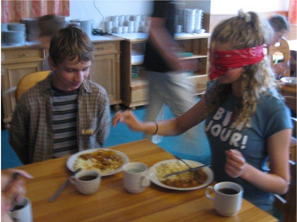
One of the numerous team-building activities of the summer camps of Mensa of the Czech Republic. The participants have to feed one another while blindfolded.