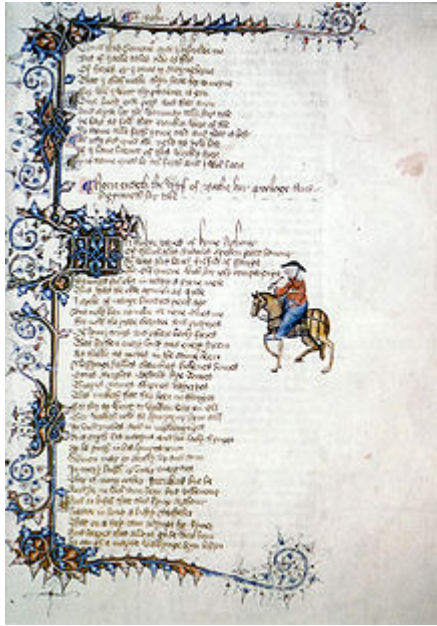
8. The opening page of “The Wife of Bath’s Tale” from the Ellesmere manuscript, 15 th century 8