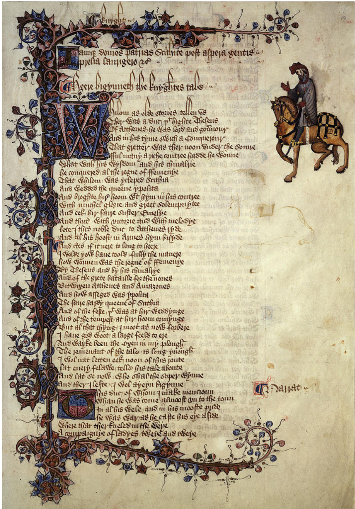
7. The opening page of "The Knight's Tale" from the Ellesmere manuscript, 15 th century 7