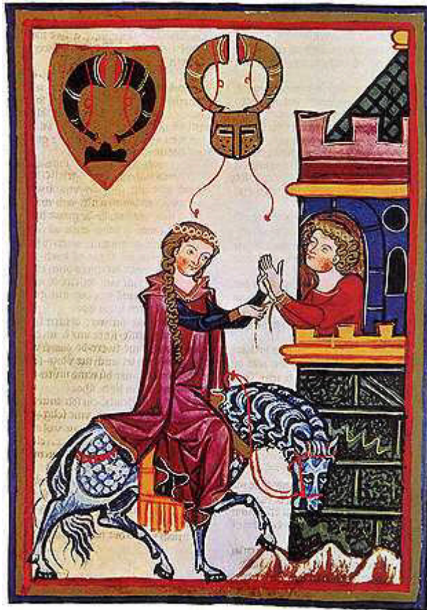
3. Troubadour bound with a golden thread of love, from the 14 th century Manesse Codex, a collection of minnesinger verse 3