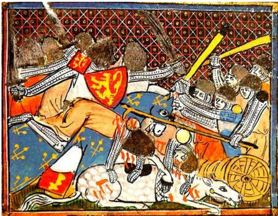
4. The Battle of the Golden Spurs at Courtrai in 1302, a 14 th century illustration 4