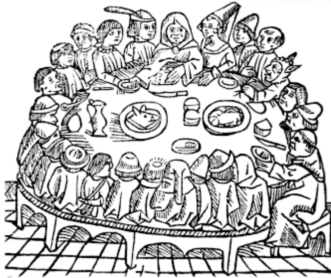
5. A woodcut from William Caxton's second edition of the Canterbury Tales printed in 1483 5