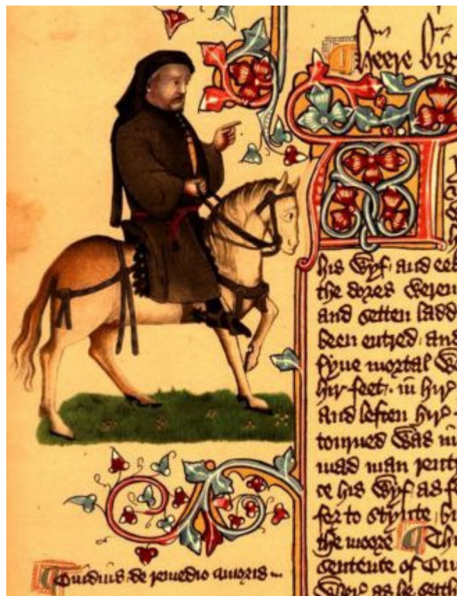
9. Chaucer as a Pilgrim from the Ellesmere manuscript, 15 th century 9