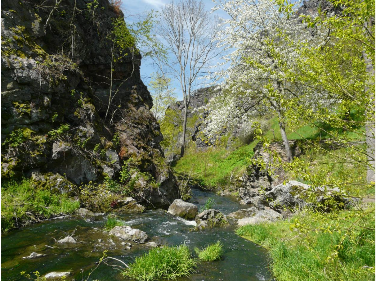
Obrázek 2 - Přírodní prostředí