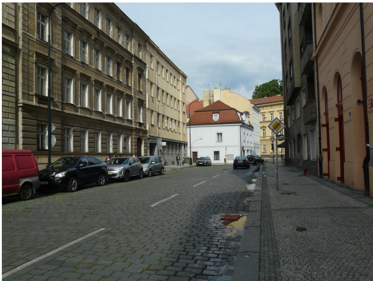
Obrázek 3 - Městské prostředí