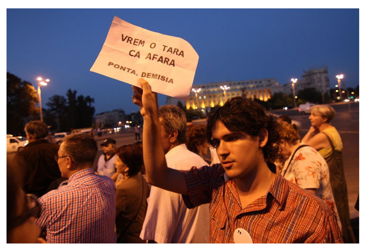
Figure 6: Protesters with the slogan "We want a country like abroad!"

Protests against OUG13 in 2017 were the culmination of the government's efforts to slow down anti-corruption measures. However, some elites had joined the discourse by this point, and the protests had definitively ceased to be anti-establishment. As Olteanu and Beyerle point out, patriotism and belonging to a European identity played a much more significant role here.<sup>205</sup> The OUG 13 protest was the first major pro-European and pro-Western protest in post-Brexit Europe, with protesters expressing dissatisfaction not only with the political establishment but especially with how politics is done.<sup>206</sup> The discourse that the protesters chose with the slogan "Vrem o ţară ca afară!" (We want a country like abroad) (see Figure 6) highlights the dichotomy of the mobilising anti-corruption narrative that pits Romania's local "corrupt elites", who are "left behind", against modern Western democracies.<sup>207</sup>