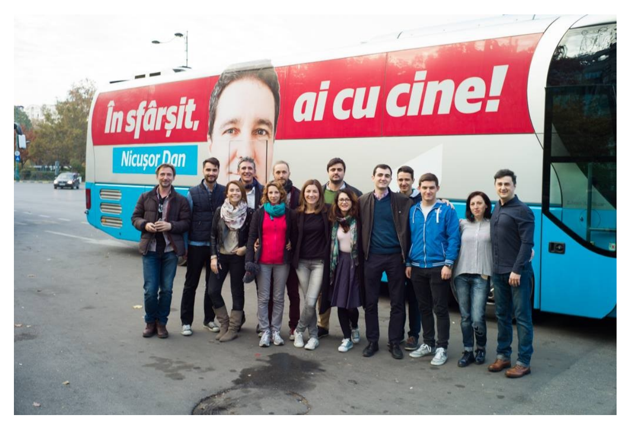
Figure 13: USR's 2016 Parliamentary slogan "Finally, you've got someone (to vote for)". "We decided to run because we felt the need for an alternative to the current political class." [Ne-am decis să candidăm pentru că am simțit nevoia unei alternative la clasa politică actuală.], USR Facebook page, December 9, 2016,

https://www.facebook.com/USRUniuneaSalvatiRomania/photos/a.1133077476783435/1208766699214512.