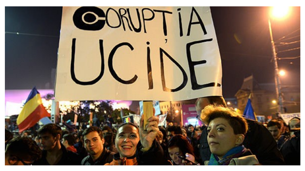
Figure 4: Slogan "Corruption kills." Artur Widak, Collective responsibility , November 12, 2015, https://www.economist.com/europe/2015/11/12/collective-responsibility.

Corruption became the main frame in the protests after the tragedy at the Colectiv Club in 2015, considered the culprit responsible for the lax enforcement of safety and fire regulations and the trivial state of the Romanian healthcare system. Kiss and Székely point out that "anti-corruption rhetoric was far more than an electoral instrument. It became a powerful political metanarrative, a dominant frame of grassroots protest movements and an identity discourse embraced by large segments of the Romanian society." The perceived role of corruption in the fire featured prominently in the slogans of the protests, such as "Corruption Kills" (see Figure 4), alongside demands for system change and the resignation of officials ("Down with Parliament!"). Other slogans deplored the dominance and corruption of the Orthodox Patriarchate ("We want hospitals, not cathedrals"). 198