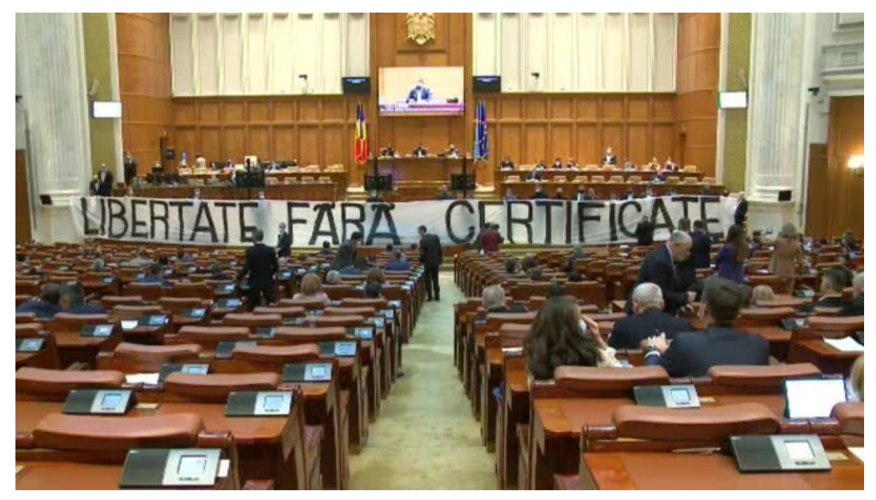
Figure 14: AUR party protesting against Covid-19 vaccination certificates with banner "Freedom without certificates" in the Chamber of Deputies.

AUR is not only in a way a successor to USR's brand of political radicalism but also incorporates part of the Rezist legacy, yet voided of its pro-European, good governance ideology. The political style of early USR and AUR are characterized by disruptive, sometimes aggressive interventions in Parliament. AUR and George Simion use many disruptive techniques, including live recordings, posters and banners in Parliament (see Figure 14), or heckling. Their obstruction of Parliament gained momentum notably during the Covid-19 pandemic. The pandemics facilitated the transfer of anti-establishment voters from USR to AUR. USR is stagnating and no longer has convincing messages, while AUR is positioned as the main opposition force, managing to attract their votes.