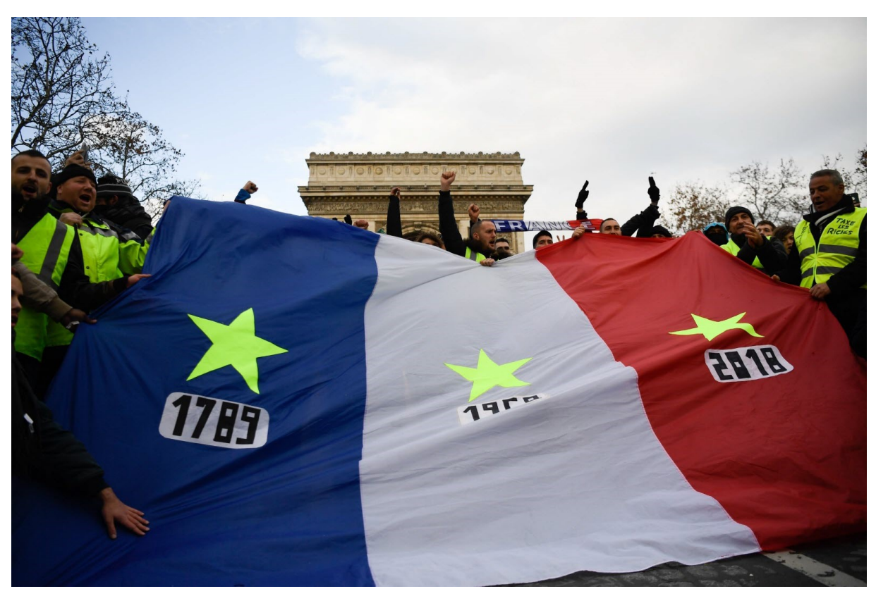
Figure 11: The Yellow Vests parallels with other French protests (1789, 1968, 2018). Bertrand Guay, Des gilets jaunes tôt ce matin devant l'Arc de Triomphe, à Paris, photograph, L'Alsace, December 8, 2018, <a href="https://www.lalsace.fr/actualite/2018/12/08/gilets-jaunes-du-calme-aux-heurts-les-terribles-images-de-lacte-iv">https://www.lalsace.fr/actualite/2018/12/08/gilets-jaunes-du-calme-aux-heurts-les-terribles-images-de-lacte-iv</a>.

This apparent inconclusiveness caused uncertainty across the political spectrum. The left feared that the movement was a form of poujadism or a radical right-wing movement. The neoliberal elites either expressed sympathy for the protesters or the use of repressive forces; however, even the right wing was not sure how to deal with the movement. Is it better to prioritise maintaining order or using the opportunity to undermine the government's and the President's authority?<sup>272</sup> The Yellow Vests movement was challenging to classify on the ideological level, but classifying it as a nationalist or xenophobic movement would be an oversimplification, as it was more of a movement for social and economic justice.<sup>273</sup>