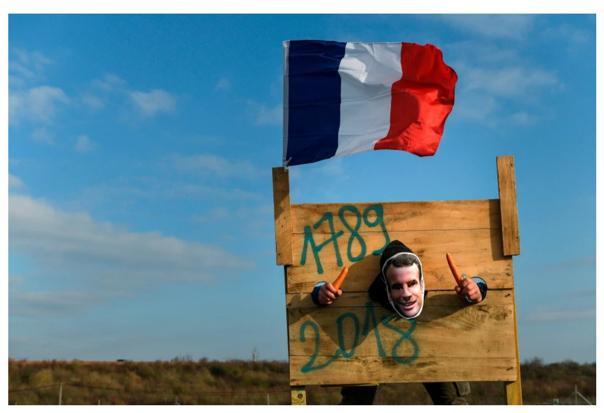
Figure 10: Guillotine, the French Revolution parallel with Yellow Vests. Sebastien Bozon, A man poses on a pillory with a French flag during a demonstration against rising fuel prices on Nov. 17, 2018 in Dole, France, photograph, Foreign Policy, December 1, 2018, <a href="https://foreignpolicy.com/2018/12/01/the-technocratic-king-and-the-guillotine/">https://foreignpolicy.com/2018/12/01/the-technocratic-king-and-the-guillotine/</a>.

disconnected from his fellow citizens. The parallel with the 1789 Revolution was heavily exploited (see Figure 10). 265