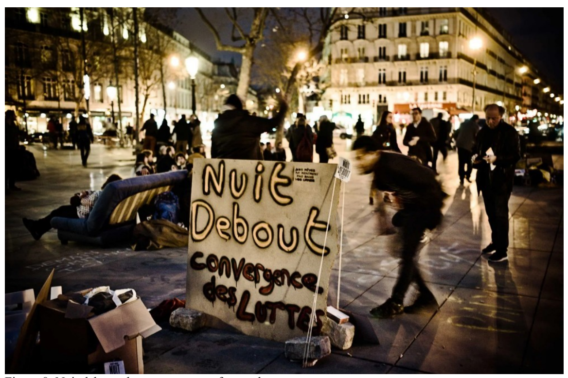
Figure 8: Nuit debout, the convergence of struggles. Stephane Lagoutte, "The movement of the Nuit Debout, loosely translated as "Standing Up at Night," at the Place de la République in Paris, April 4, 2016", TIME, June 7, 2016, https://time.com/4324214/francenightly-protests/.

recruit.<sup>237</sup> Significant space was given to the idea of "convergence of struggles" to avoid distractions or leadership/faction fights (see Figure 8), creating a "public property" display of direct democratic practice. While "convergence of struggles" has been a theme in previous movements, including the May 68, a strictly leaderless structure without figureheads was uncommon.<sup>238</sup> At its peak, the movement mobilised approximately 400 000 people and created a network of hundreds of Nuit debout groups and committees in France and abroad. Its mobilisation continued until the law passed; its visibility then steadily declined.<sup>239</sup>