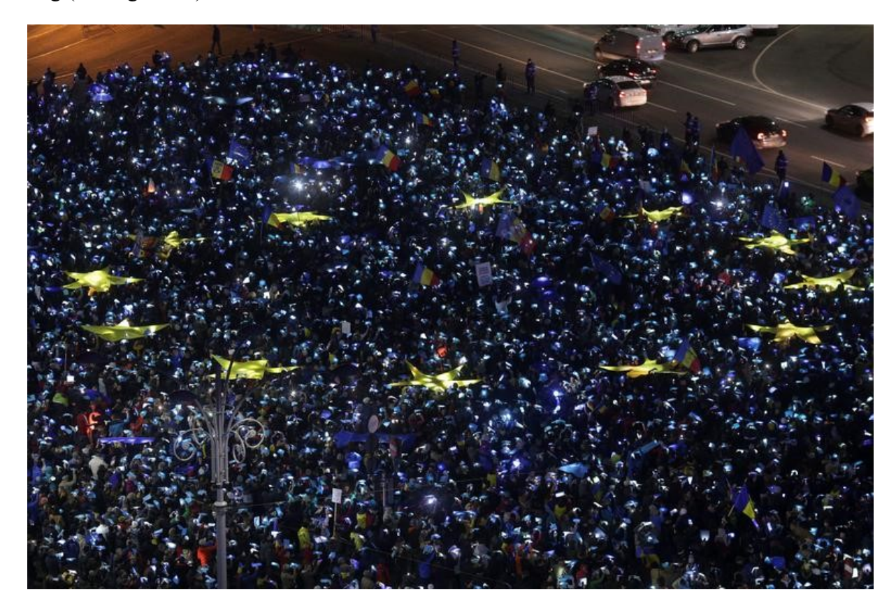
Figure 15: Protesters in Bucharest forming the European flag. Octav Ganea, Thousands of Romanians form EU flag at anti-government rally , Reuters, February 27, 2017, <a href="https://www.reuters.com/news/picture/thousands-of-romanians-form-eu-flag-at-a-idUSKBN1650WU">https://www.reuters.com/news/picture/thousands-of-romanians-form-eu-flag-at-a-idUSKBN1650WU</a>.

For this reason, the Romanian protests, unlike the French ones, were initially anti-communist, pro-capitalist, technocratic and distinctly pro-European, as illustrated, for example, by the protest of the 27th of February 2017, when protesters in Bucharest created a European Union flag (see Figure 15).