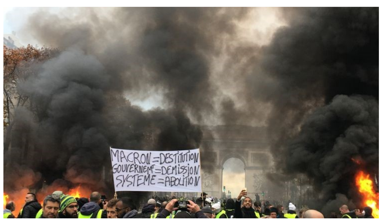
Figure 12: Yellow Vest protest with anti-establishment slogan. [Macron = impeachment, government = resignation, system = abolishment].

the ruling class. They note that reportedly 95% of the movement's members think that "elected officials talk too much and take too little action" and believe that "the political differences between the elite and the people are larger than the differences among the people". They concluded that the distrust of political representation was so strong that it affected the organisation of the movement itself. The Yellow Vests maintained a certain distance from the unions and political parties.