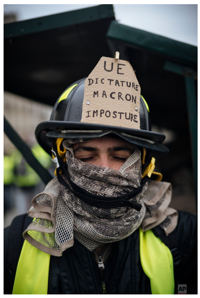
Figure 16: A Yellow Vest protester with anti-EU sentiment, [EU dictatorship, Macron imposture]. Kamil Zihnioglu, Theo , 27 , Engineer , photograph, AP, February 8, 2019, <a href="https://apimagesblog.com/blog/2019/2/8/the-varied-faces-of-frances-yellow-vest-movement">https://apimagesblog.com/blog/2019/2/8/the-varied-faces-of-frances-yellow-vest-movement</a>.