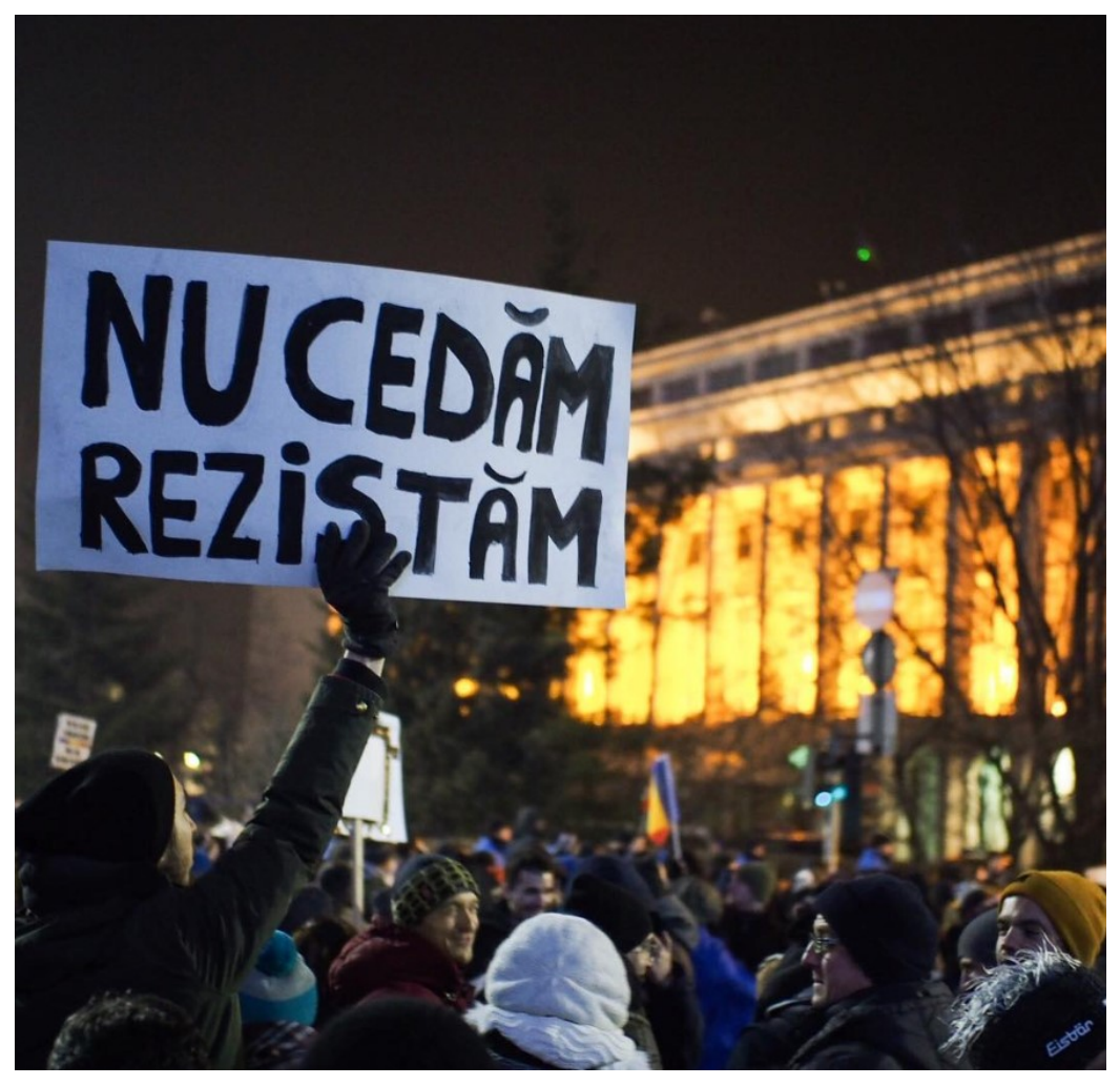
Figure 3: "We don't give in, we resist". Dragos Bucurenci [@bucurenci], "#neamtrezit #altaintrebare", Instagram, February 5, 2017, accessed March 2, 2023, https://www.instagram.com/p/BQIAfYfl5WO/.

via social media. The slogan #rezist symbolised their resistance to a corrupted government coalition and their determination to stay in the streets despite sub-zero temperatures until the OUG13 abrogation (see Figure 3).