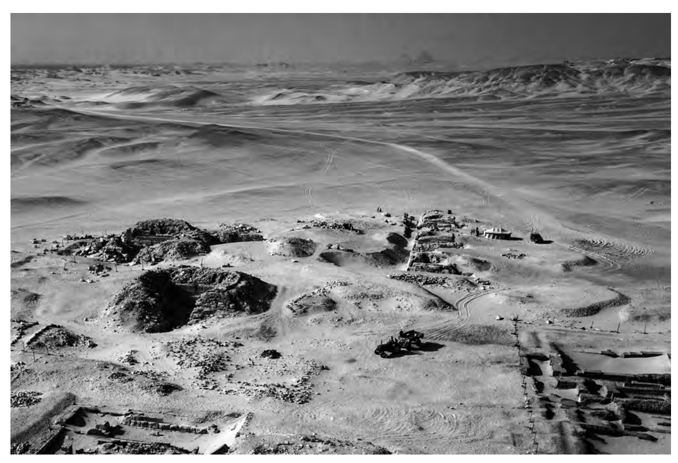
Fig. 2 Nakhtsare's cemetery from the top of Neferirkare's pyramid

The interior spaces of mastaba AC 31 were filled with layers consisting of local limestone blocks and fragments,