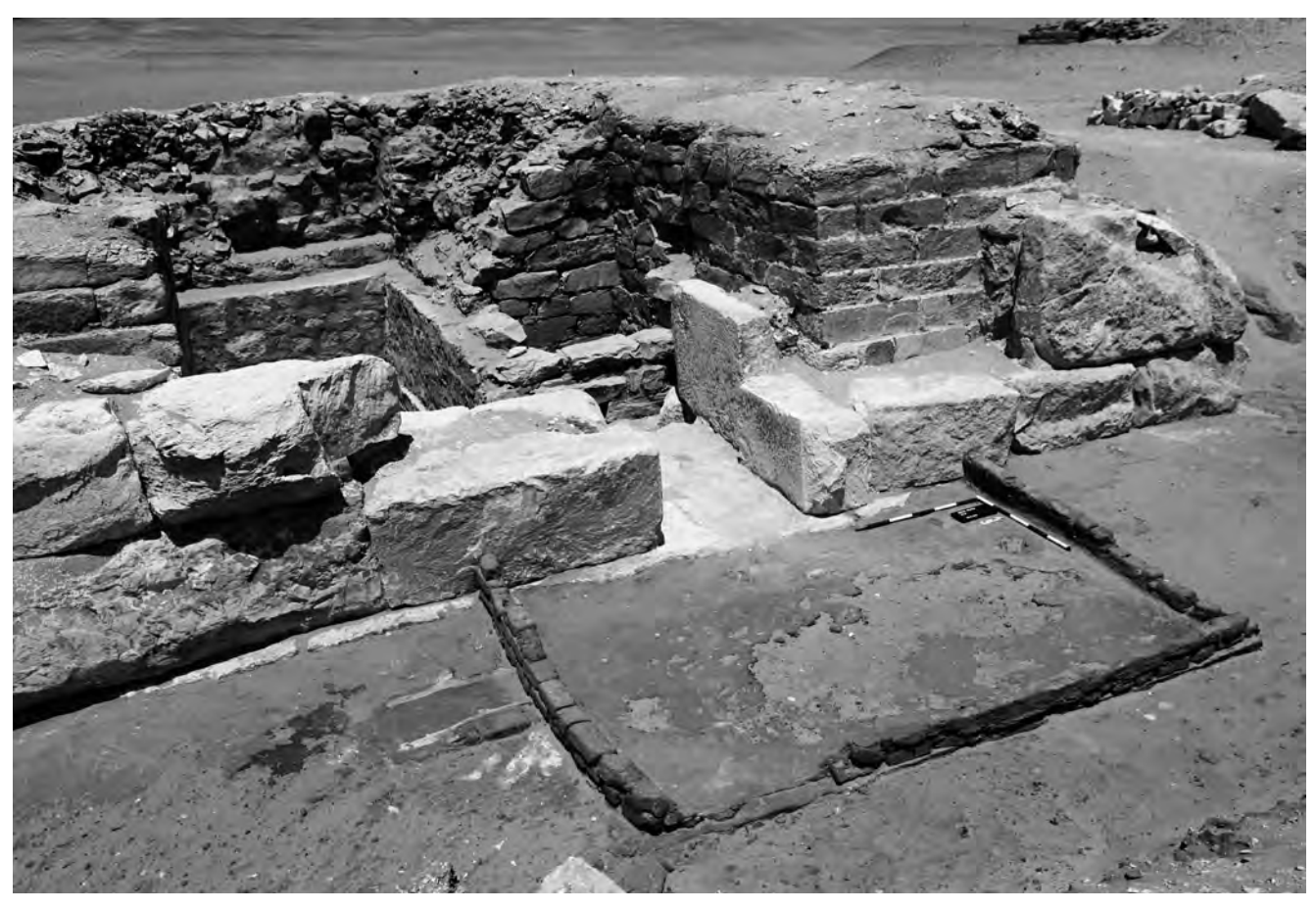
Fig. 11 The mud brick annexe built in front of the entrance