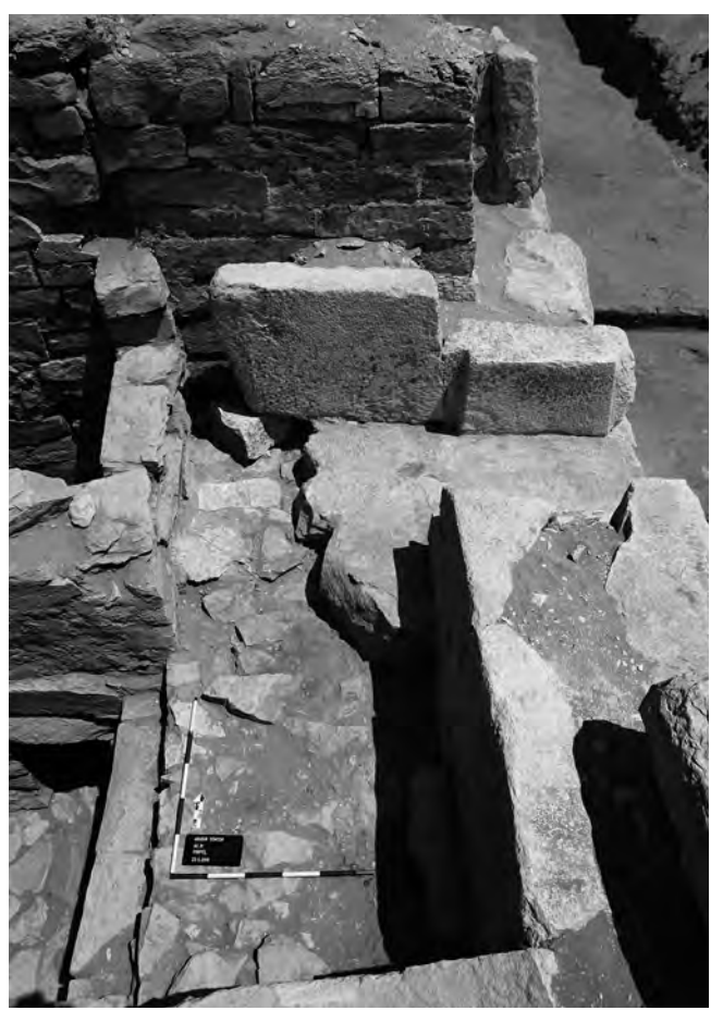
Fig. 4 The area of the offering chapel from the south

In the same level and also in the shaft's fill above this context, some items from the burial equipment of the