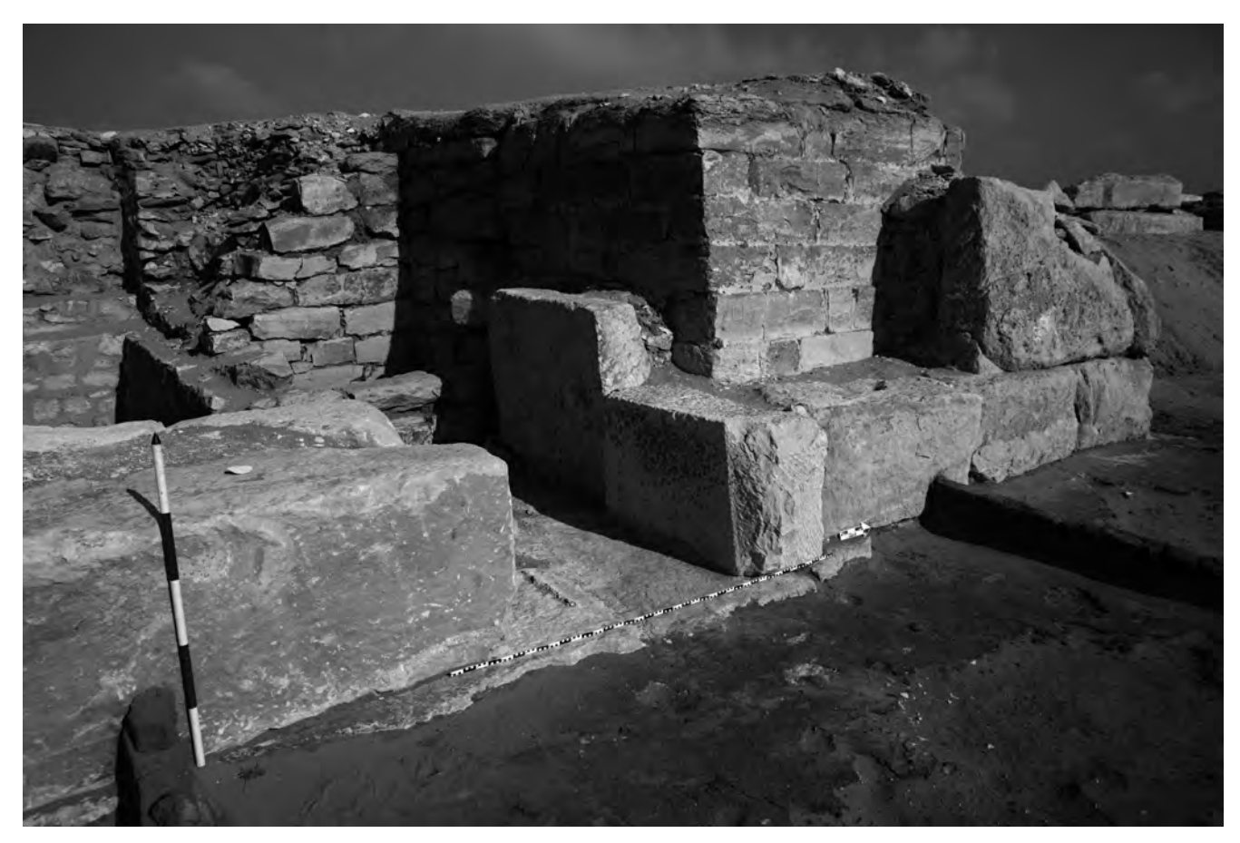
Fig. 5 The entrance to the chapel and its surroundings