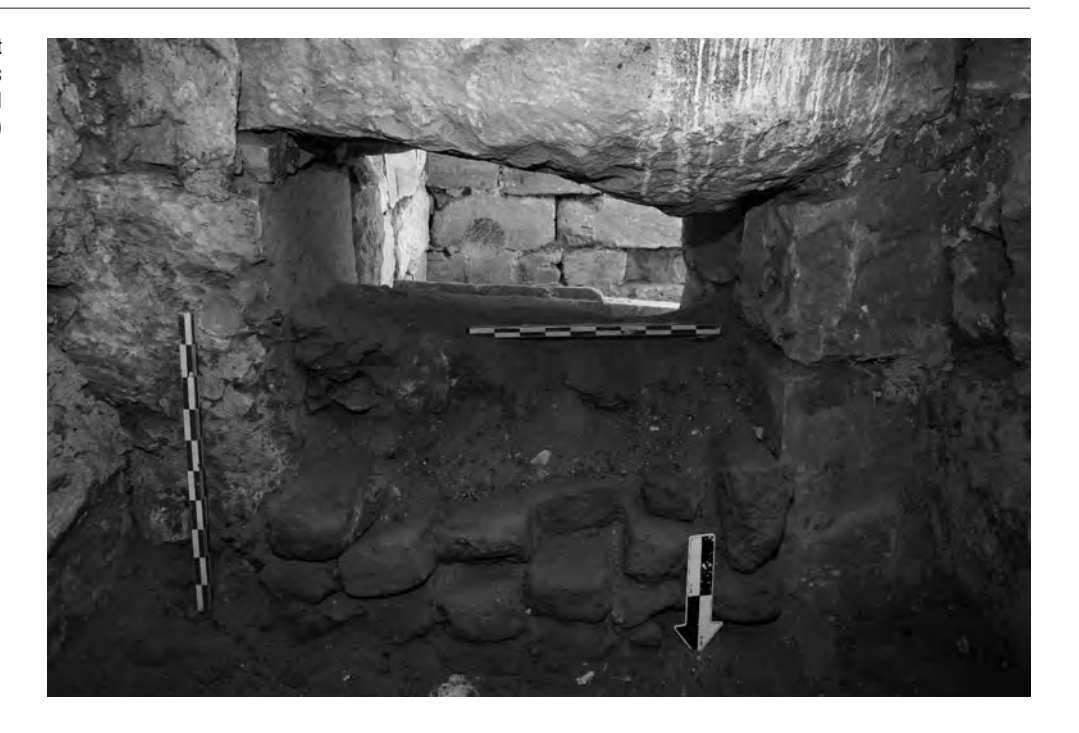
Fig. 6 The partition wall built in the entrance to the access passage leading to the burial chamber

deceased were found - e.g. three copper models (a model of a libation basin and two models of adzes: 296/AC31/2016, 315/AC31/2016 and 317/AC31/2016), some textile fragments and fragments of plant remains. Following the provenance of these items, it is apparent that these objects were brought in from the burial chamber by tomb robbers. The same counts for other finds which were once part of the deceased's burial equipment - an almost complete wooden stand (for an object with a circular base - probably for a stone or copper model vessel; 182/AC31/2016 and 182a-e/AC31/2016), which was found in slightly higher levels of the shaft's fill.