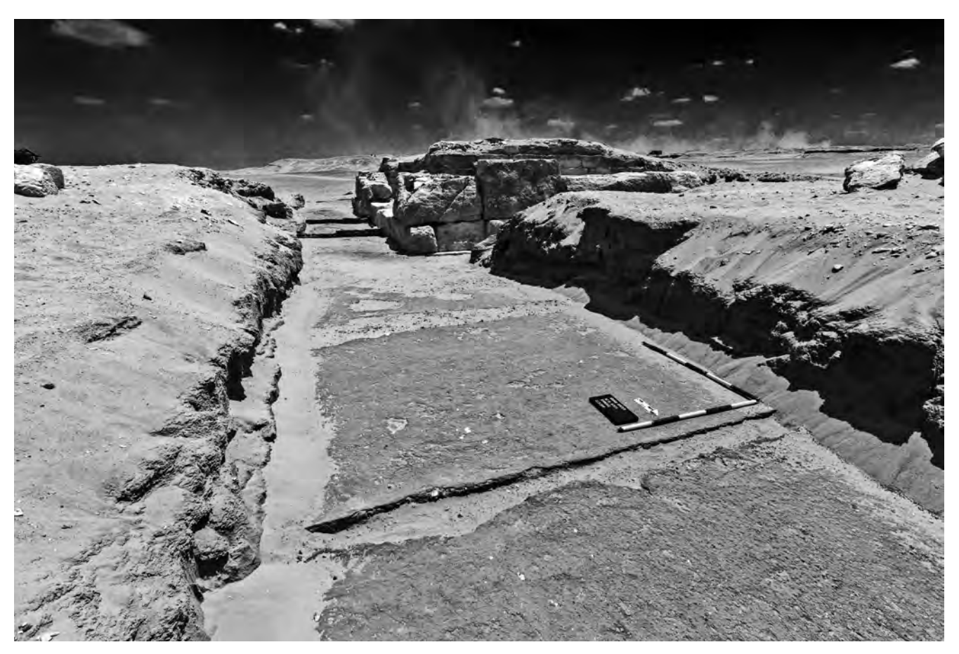
Fig. 10 The test trench between tombs AC 30 and AC 31, with the mud flooring and the negative imprint of a (mud brick?) wall