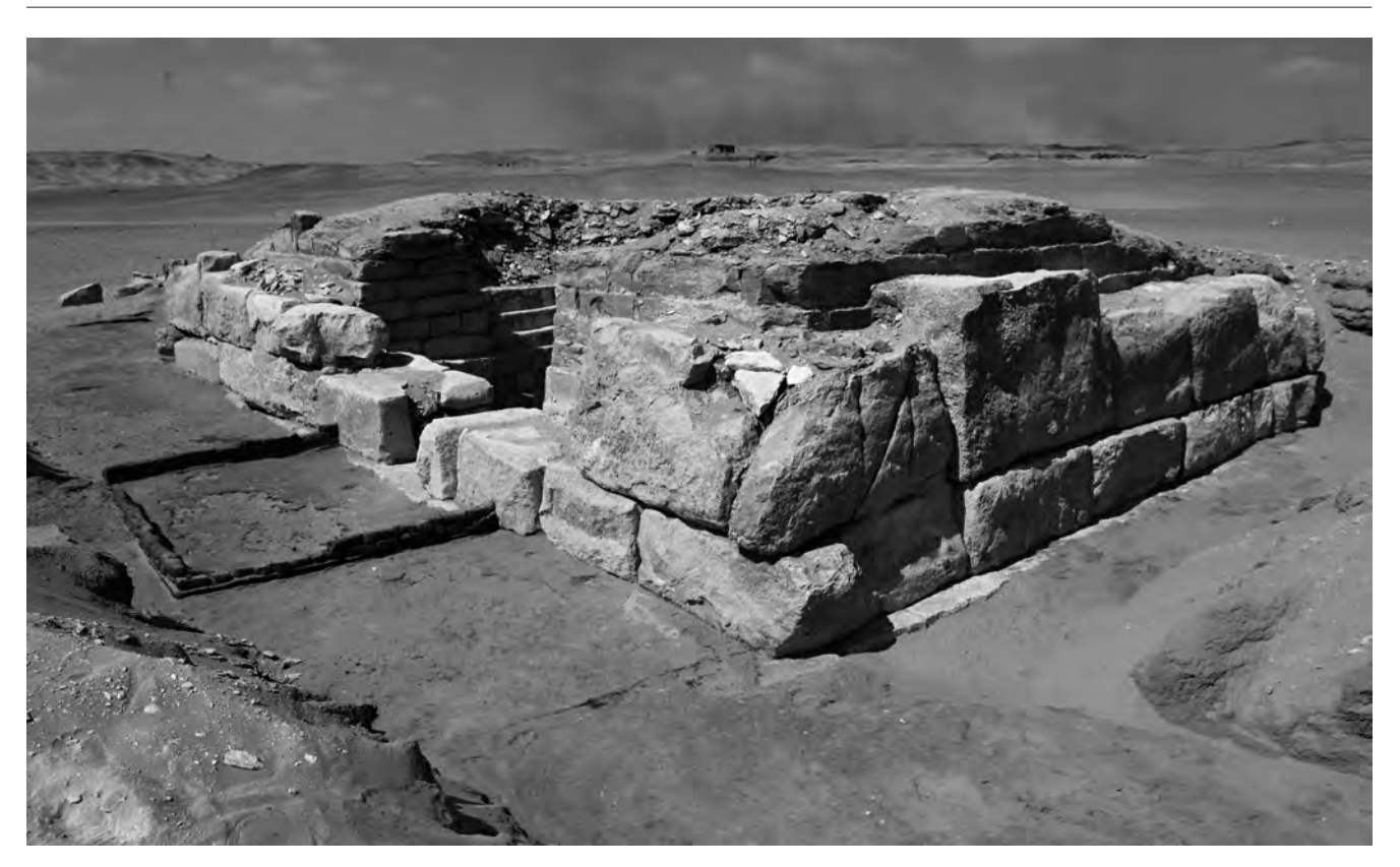
Fig. 1 An overall view of tomb AC 31 from the north-east