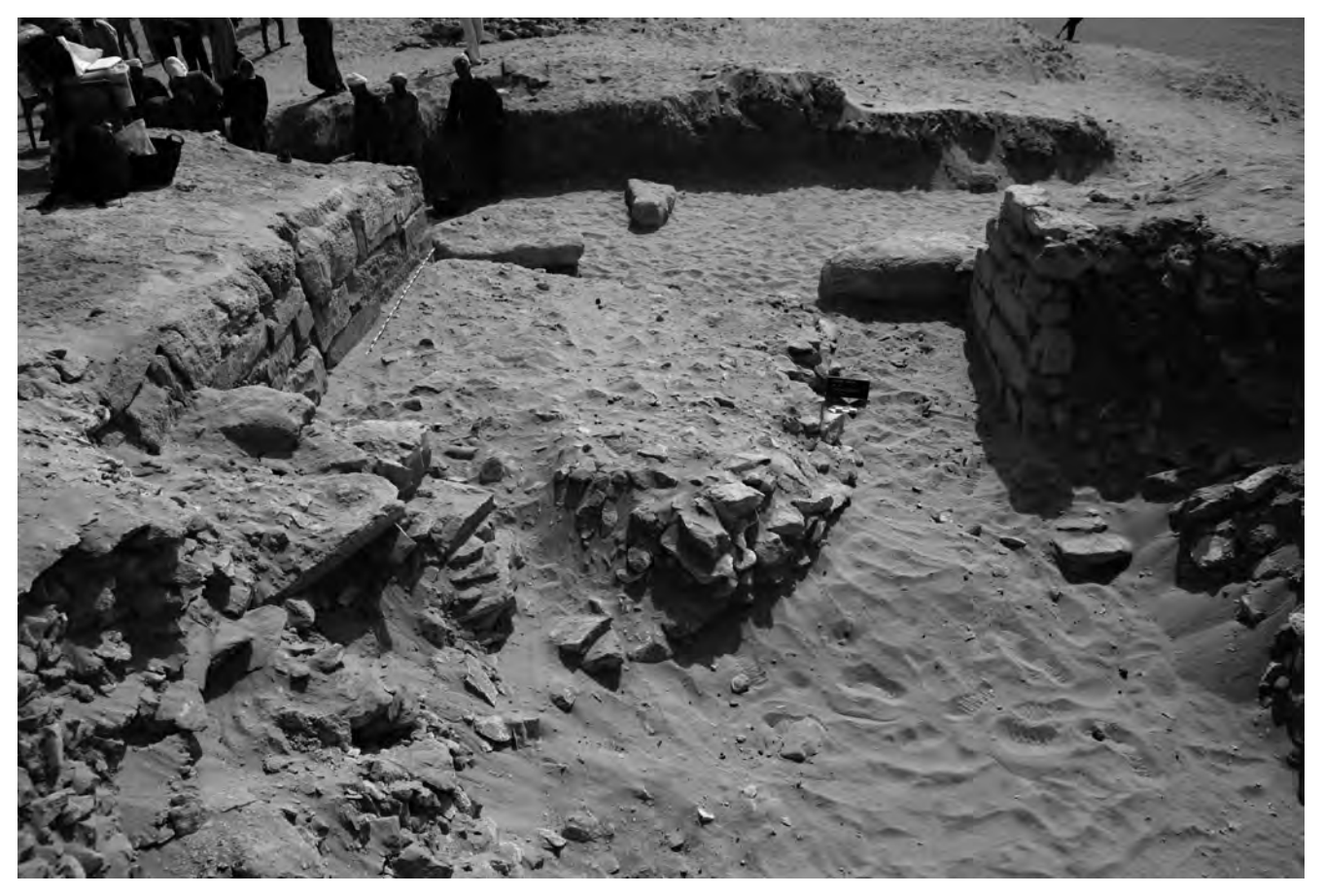
Fig. 3 The stone robbers' wall built in the area of the offering chapel and construction pit, view from the west

pottery sherds, and in the lower levels of fill, broken mud bricks. During the research, it was clear that the greater part of the contexts of pottery discovered inside (and outside) the tomb were secondary in nature. On the other hand, intact contexts were discovered in the lowermost portion of the fill of the burial chamber and vertical shaft; they are thus the most important archaeological contexts (see below) excavated in the mastaba.