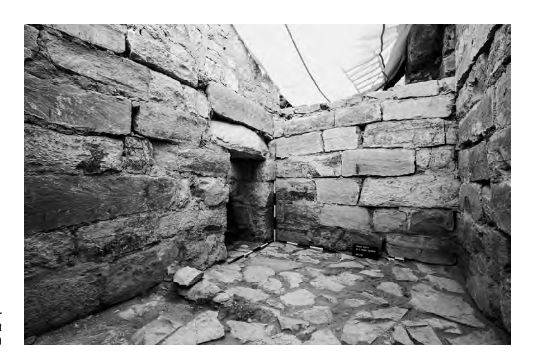
Fig. 7 The burial chamber from the south-west

Also in the architecture of the tomb's substructure, one can confirm the uniformity of the architecture of the individual monuments in Nakhtsare's cemetery. The substructure in AC 31 can be assigned to types 3 or 4 of Reisner's typology (Reisner 1942: 87, figs. 21-22).