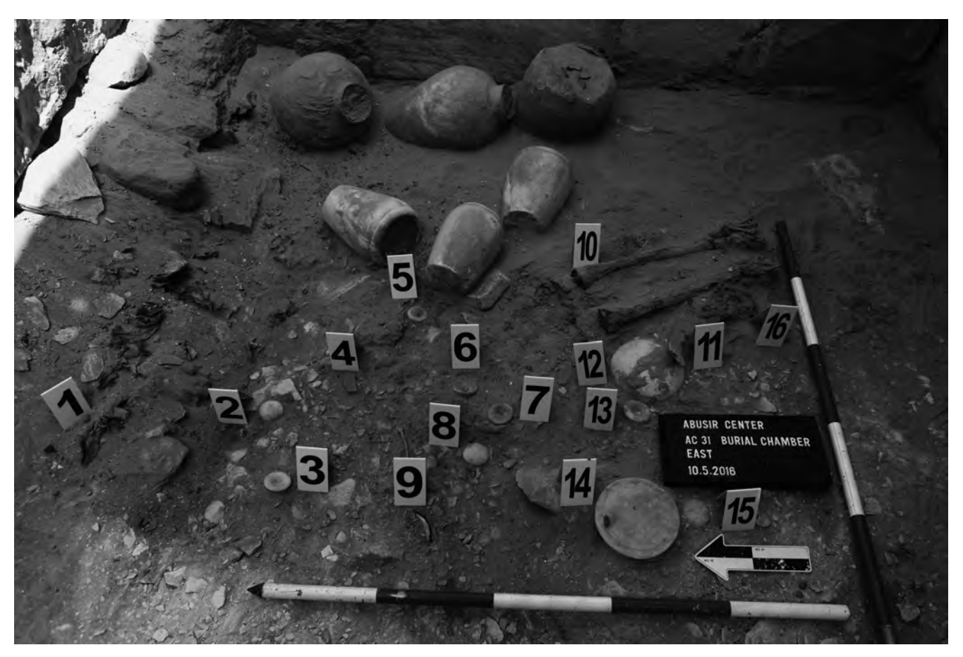
Fig. 8 The items from the burial equipment in situ in the eastern part of the burial chamber

objects found in tomb AC 31 represent, together with those from tomb AC 29, important attestation of the components of the funerary equipment of the then elite, which has not yet been evidenced on a large scale through the results of the archaeological excavations.<sup>5</sup> Besides this, the collection of copper models found in tomb AC 31 represents a complete set of models, which is standard for the period