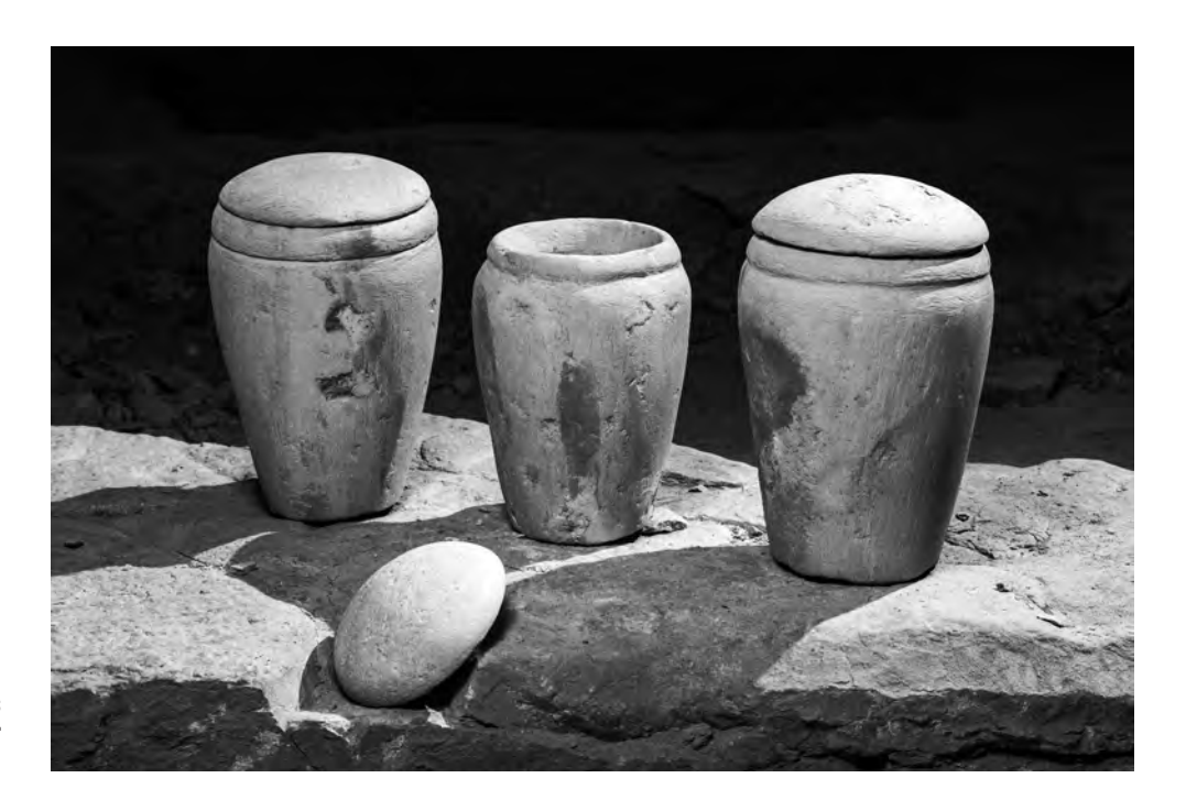
Fig. 9 The canopic jars and lids found in the burial chamber

in which the tomb came into existence (Martin Odler, personal communication). Nevertheless, the quality of the travertine model bowls is not the highest (the tubular model vessels are exception in this respect and were made of material of a higher quality and precision). The same may be said for the canopic jars, which are not made with the utmost accuracy and also show traces of surface repairs –