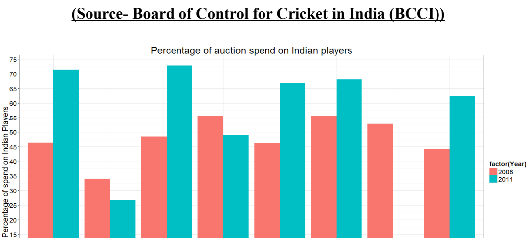
FIGURE-3: SPENDING ON INDIAN PLAYERS

However, compared to the 2008 model the R<sup>2</sup> seems to be the only positive aspect as important components like the AGE, and a batting all-rounder is still insignificant. While the reason for the national dummy can be explained, the rest of the variables have no such explanation. The output with an equation having the variables corresponding to only the international players also proves to be inefficient and hence we can conclude that the model requires a refined specification. Hence, the renined model would be working on the same by introducing a new set of variables that are specific to IPL (runs scored and wickets taken in IPL) and also would keep a check on the problem of endogeneity.