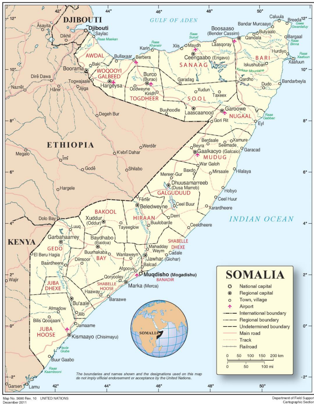
Příloha č. 1: Mapa Somálska