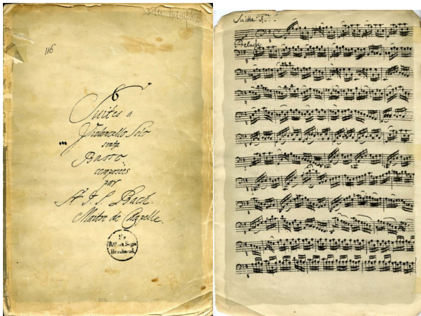
Obrázek 5, 6: rukopisy cellových suit z pera A. M. Bachové