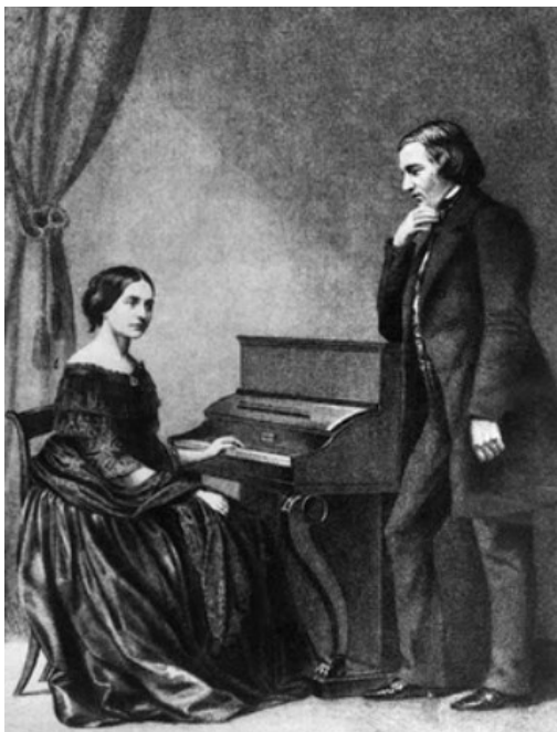
Obrázek 14: Clara a Robert Schumannovi při diskusi nad společnou tvorbou