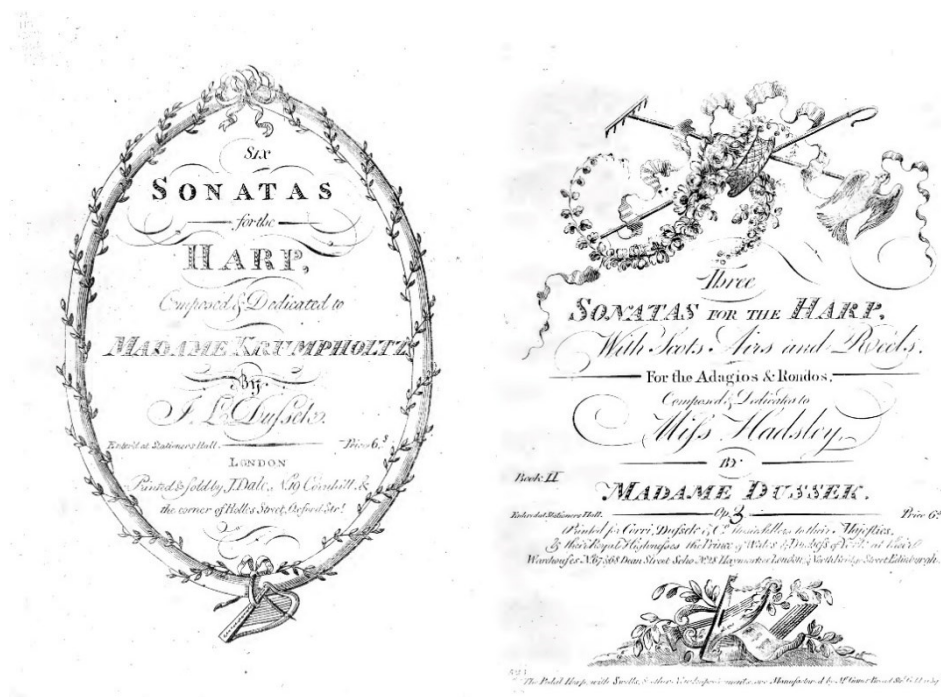
Obrázek 12, 13: frontispis; 6 sonát op. 2 a 3 sonáty op. 3 z r. 1794