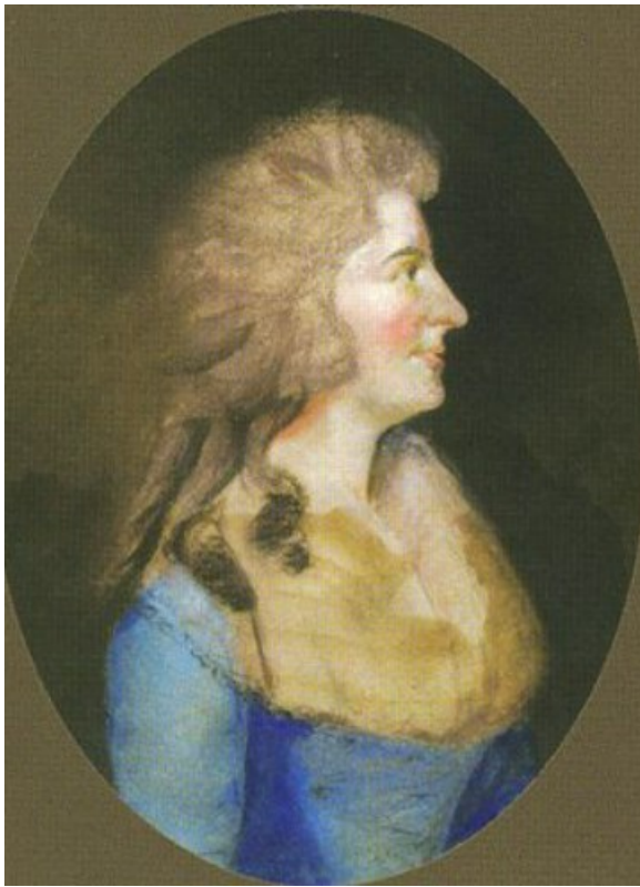
Obrázek 11: portrét Sophie Dussek