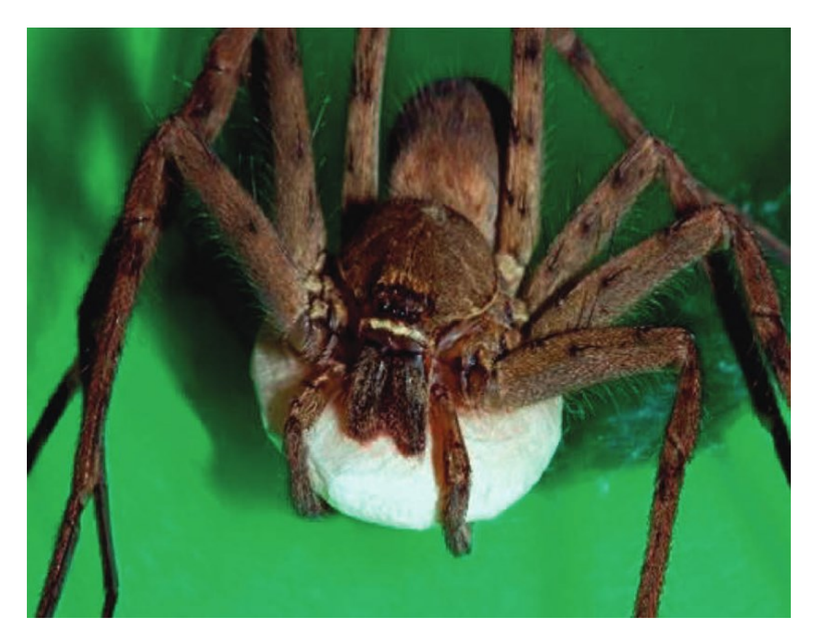
Figure 1: Female of Heteropoda venatoria (Sparassidae) guarding its egg sac by carrying it underneath its body in pedipalps. Taken from Ewunkem and Agee 2022.

Some spiders always carry their cocoons wherever they go. Females of the spitting spider Scytodes sp. carry their egg sac in their chelicerae (Li et al. 1999), the same way as the nursery web spiders Pisauridae do (Fink 1987). Wolf spiders (Lycosidae) carry their cocoons attached to their spinnerets (Eason 1964; Ruhland et al. 2016), and huntsman spider Heteropoda venatoria (Sparassidae) carries the cocoon in its pedipalps underneath the body (fig. 1) (Parr 2016).