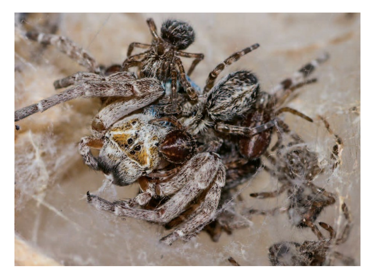
Figure 2: Stegodyphus lineatus (Eresidae) spiderlings eating their mother by matriphagy. Taken from Royle et al. 2014.

Matriphagy is the consumption of the living mother by its offspring (fig. 2) (Toyama 2001).