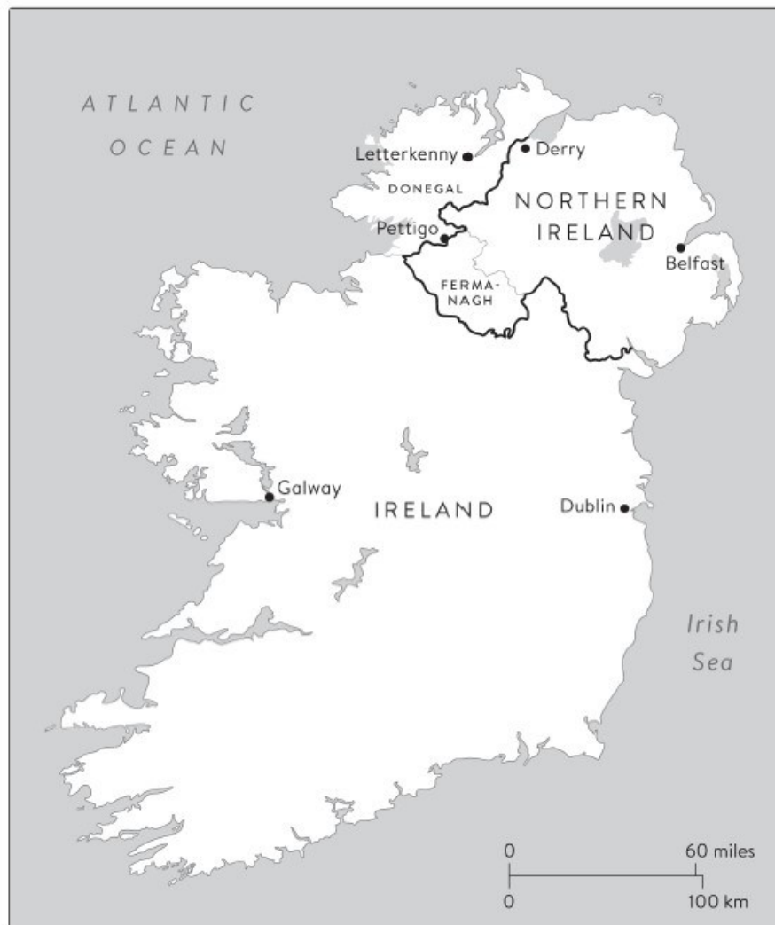
Figure 10.1 The Irish Border

Zdroj: O'ROURKE, Kevin. A Short History of Brexit. From Brentry to Backstop . Penguin Books. 2019 str. 226