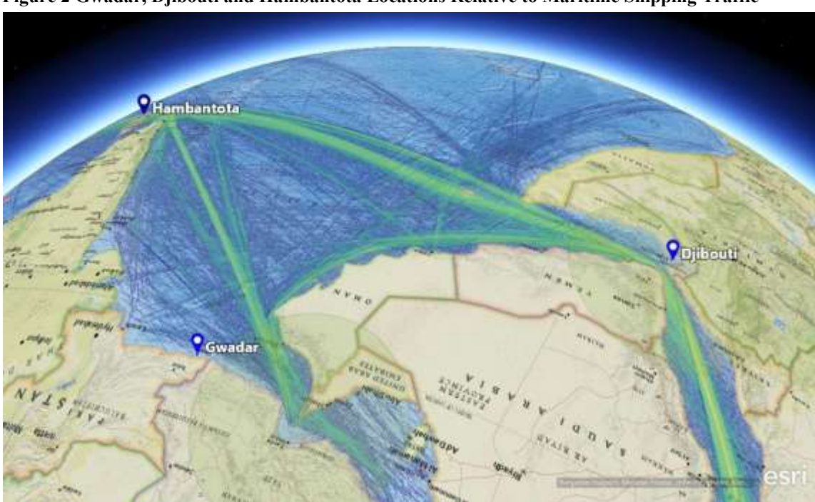
Figure 2 Gwadar, Djibouti and Hambantota Locations Relative to Maritime Shipping Traffic