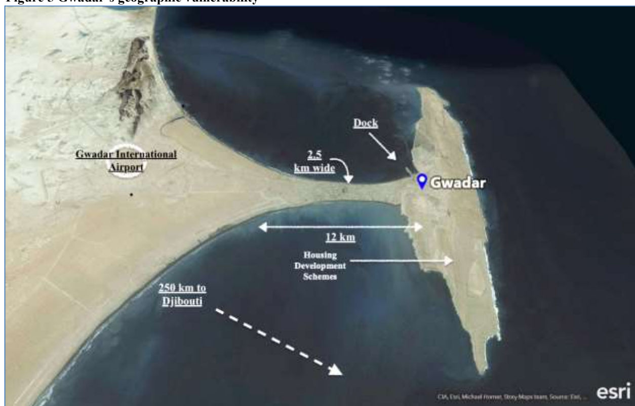
Figure 5 Gwadar's geographic vulnerability