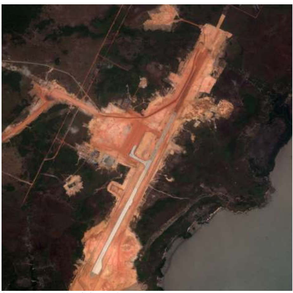
Figure 7 Military size runway located in Dara Sakor, Cambodia, near to Koh Kong